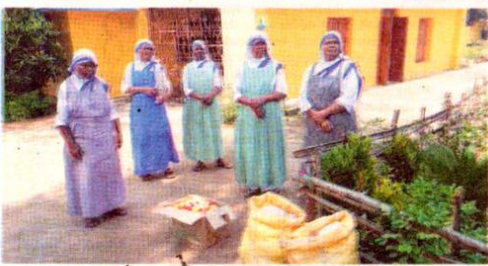
THE DO-GOODERS: The two institutions are providing groceries and cash for miscellaneous expenses to over 40 orphanages, old age homes and leprosy centres in Kandhamal district

Here's a look at a few humanitarian gestures of KIIT and KISS that stand out as they have helped ease the COVID burden