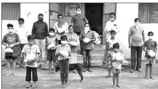
KIIT and KISS members after distributing ration among children.

"KIMS Covid Hospital in Bhubaneswar, a 500-bedded state-of-the-art facility